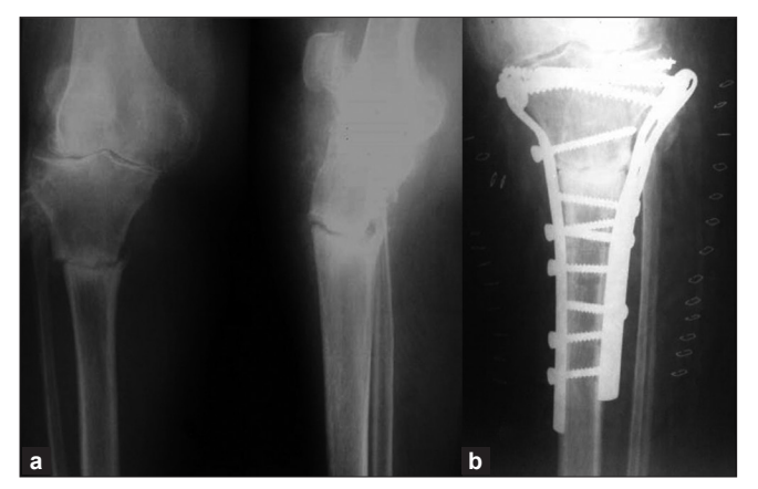
Figure 1: (a) Radiograph showing stress fracture of proximal tibia; (b) dual plating using two incision as the fracture did not show any signs of healing with 1 month of plaster cast