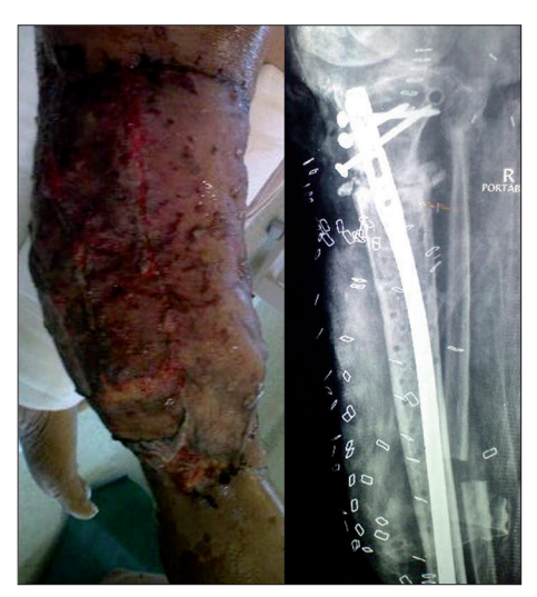
Figure 3: Latissimus dorsi pedicle flap was done to cover the wound and implant removal and intramedullary nailing was performed in a single stage