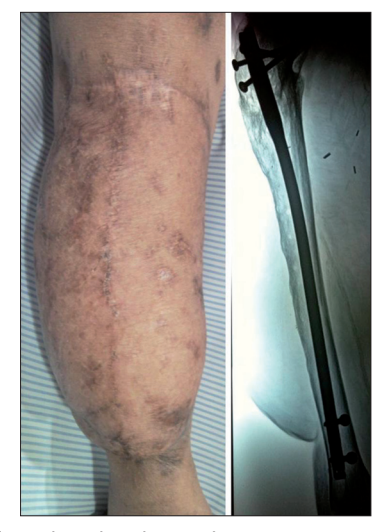
Figure 4: Clinical and radiographic appearance at 20 months postsurgery showing healing of both soft tissue and the bone

to the regimen. Postoperatively, there was no relapse of infection, and healing of both soft tissue and osseous tissue was achieved without further intervention. There was no complication associated with ozone therapy. At 20 months, the patient started leading an independent life with minimal discomfort as against the amputation offered to her. The results in our experience will help in planning further investigation in the use of ozone therapy as an adjuvant to the conventional modality for treatment of extensive orthopedic wounds.